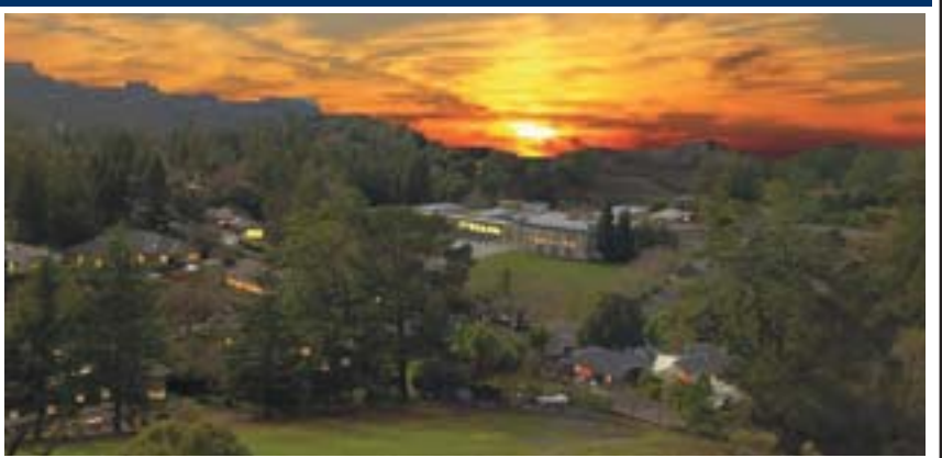
Nearly 6 Acre Private Gated Estate. Offered at $2,500,000